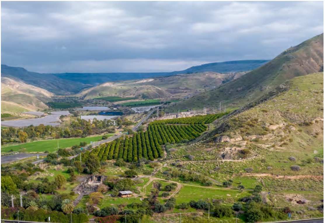
VIEW EAST: THE KURSI MONASTERY (BOTTOM LEFT) LIES IN THE BROAD VALLEY AT THE END OF NAHAL SAMACH. KURSI (BIBLICAL GERGESA) WAS THE LOCATION OF THE SWINE MIRACLE (MATT. 8:23–34; SEE “GERGESA (KURSI)” ON PAGE 265).